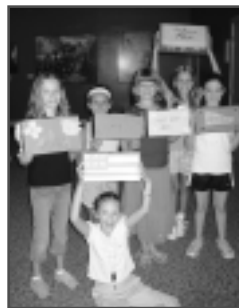
Campers are delighted with their Pioneer Camp Treasure Boxes.

This exciting camp provides a wonderful sampler of early pioneer life. Students participate in crafts such as weaving, writing with quills, and candle-making. They are part of activities such as storytelling, historic games, and nature walks. Cost: $80 per camper. Please call (502) 897-9845 to register.