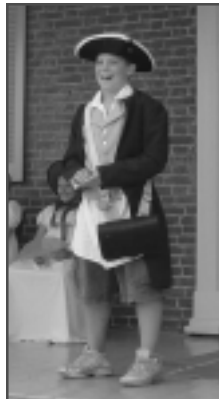
A Junior Docent Camper interprets General Clark.

Campers will look at how museums work and how they present history to the public and care for their collections of artifacts. This is a hands-on program where campers participate in activities such as creating a meal in our 19th century kitchen, trying their hand at early surveying techniques, bringing historic characters to life through costumes and first-person interpretation. $80 per camper. Please call (502) 897-9845 to register.