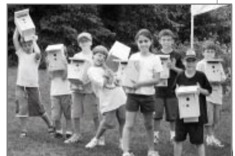
Woodworking campers show off the birdhouses they made using 19th century tools and techniques.

Thank you, also, to our great volunteers! We had 32 folks