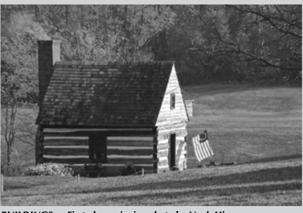
BUILDINGS — First-place-winning photo by Noah Hiner.

Over the past few years that the KJHS chapter has met at Locust Grove, members have done various service projects here. Many of them are Locust Grove volunteers and costumed interpreters. Pictured are the first-place winning photos and photographers' names.