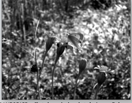
LANDSCAPE — First-place winning photo by Inanna Delaney.