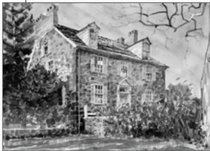
Stenhouse's "Horneblende Mansion"

Program details, including times and fees, will be available soon on Locust Grove's website, www.locustgrove.org . You can sign up for our email